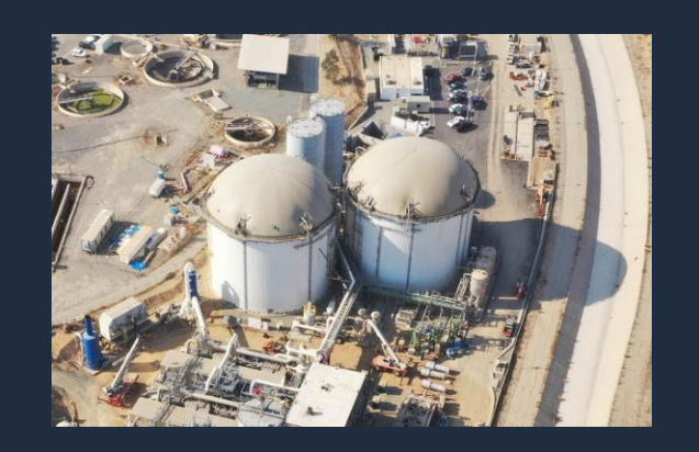
Anaergia, Rialto, California