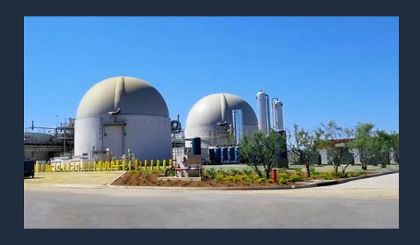
CR&R, Perris, California