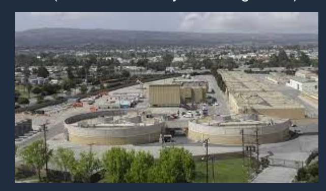
LA County Sanitation Districts, Carson, California