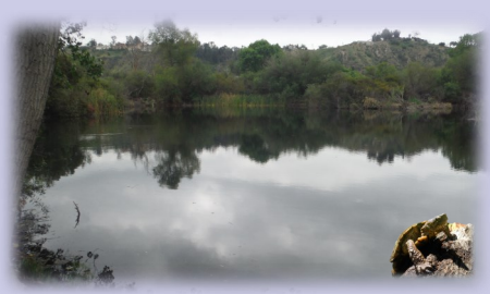
After water lettuce removal

70 cowbirds, including 9 juveniles, were removed from