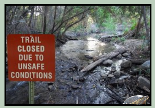
Be aware of potential heavy rainfall during an El Niño year!

An El Niño occurs when winds along the equator in the Pacific Ocean weaken, causing surface temperatures of the ocean to warm up slightly. The warmer water can cause warmer-than-