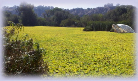
Before water lettuce removal

Brown-headed cowbird trapping began in 2001 and