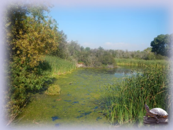
After giant reed removal

A whopping 15 acres of giant reed - that's enough to fill 15 football fields - were present on the site when LACDPW first purchased Big T. After several large scale removal efforts and years of maintenance, we are proud to report that only small areas of re-growth remain and are visited frequently during exotic plant removal efforts. In fact, the tiny stands are so small that they weren't even mapped during vegetation community mapping effort in 2014!