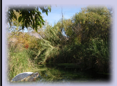
Before giant reed removal

Shortly after purchasing, LACDPW undertook the overwhelming task of cleaning up the site to make it live up to the strict and high standards of becoming a mitigation area! In the beginning, quarterly meetings were held to listen to questions and concerns from Big T's many neighbors and visitors. Many different types of surveys were also conducted, including mapping the existing vegetation, assessing the trails system, surveying for special status wildlife species including arroyo toad, southwestern willow flycatcher, least Bell's vireo, and native fishes. Then the enhancements began!