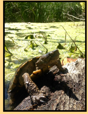
Southwestern pond turtle.

The species you may see at Big T is the southwestern pond turtle. It is important to leave these turtles in their natural habitat. You may see a turtle wandering on dry land but do not pick it up. It could be foraging for food or laying eggs. Returning turtles to the water could potentially disrupt their natural behaviors. Consider yourself lucky if you happen to spot one of these cool turtles at Big T, but make sure not to disturb it or pick it up!