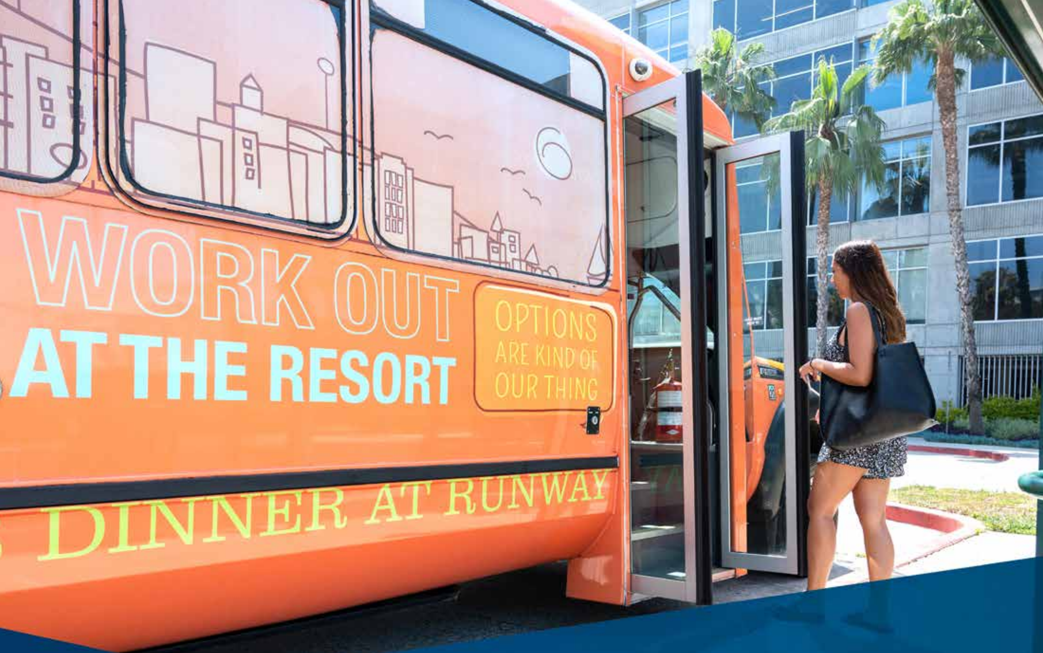
Marina Del Rey Shuttle Bus