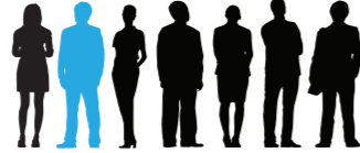
1 in 7 living in LA County live with food insecurity.

To have all businesses operating in County unincorporated areas safely donate excess edible food to feed people in need in Los Angeles County.