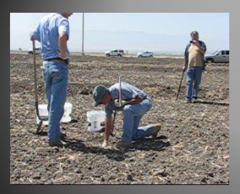
Sampling and testing