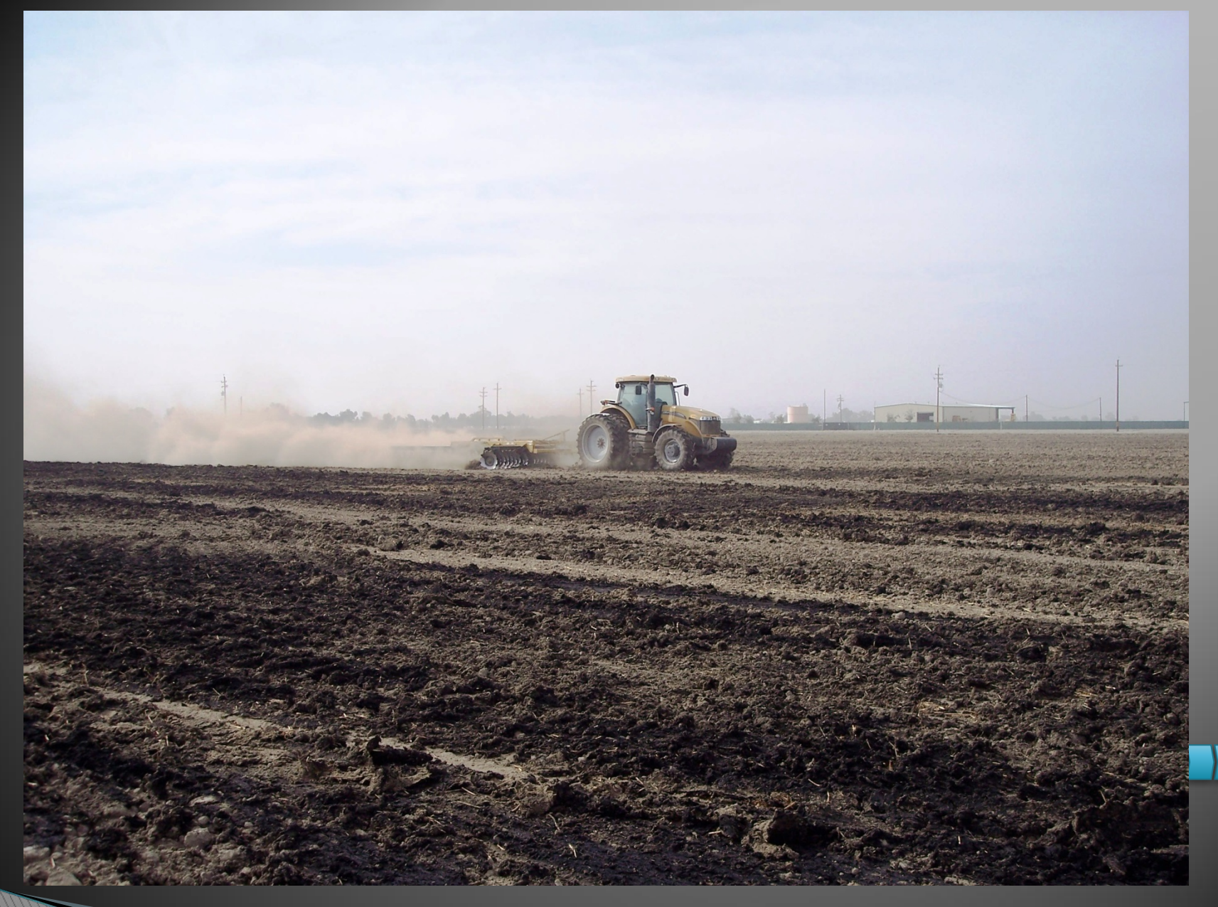
Land Application Spreading of Biosolids