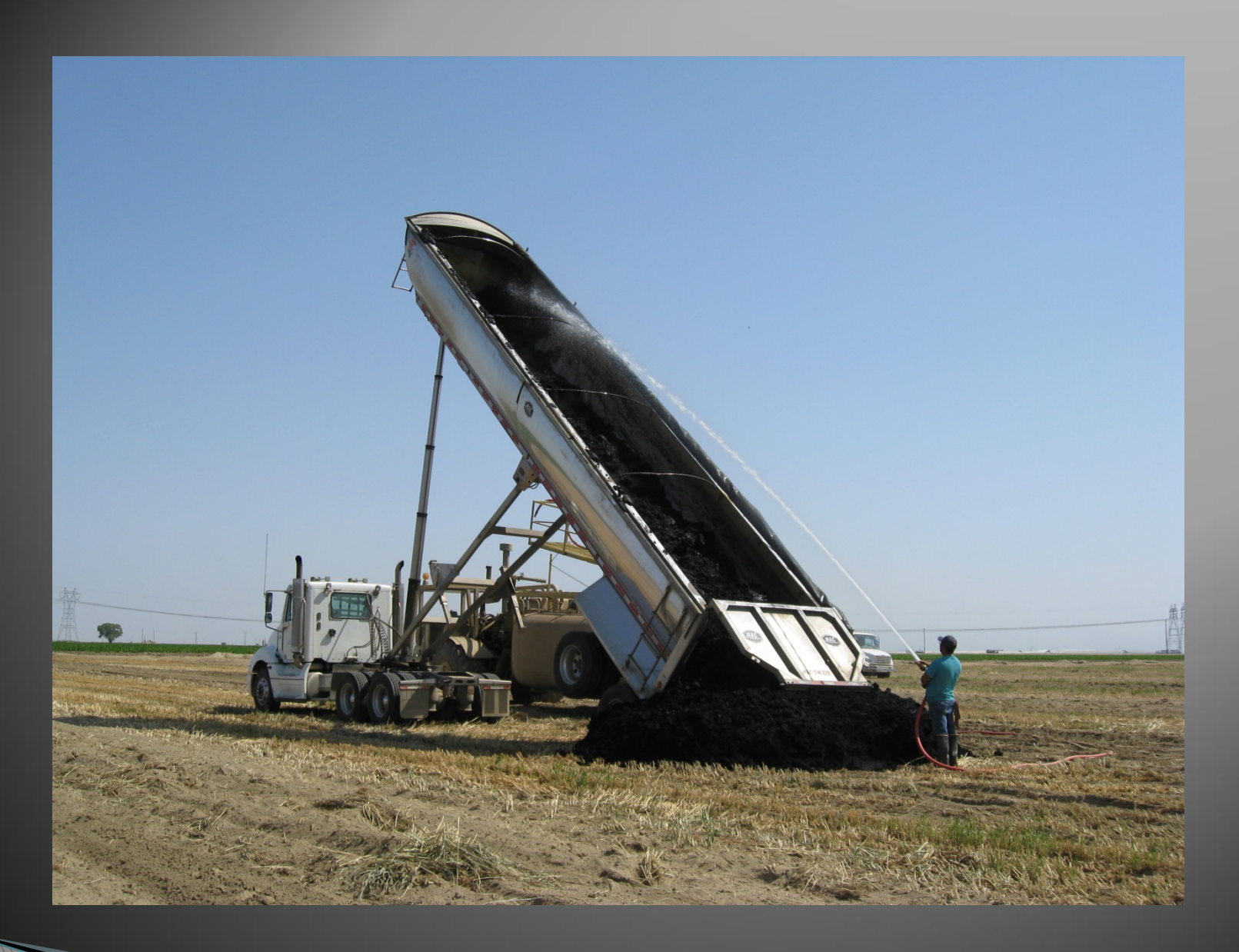
Off-loading biosolids at the farm...