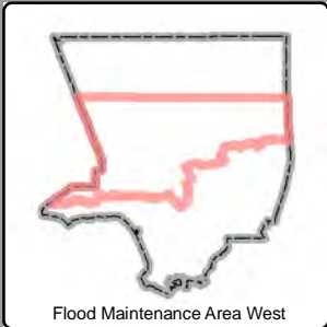
Flood Maintenance Area West