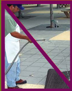
Do not wash floor mats outside where water will run off directly into the storm drain. Do not rinse spills into the street.