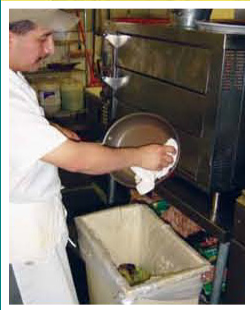
Wipe pots, pans, and work areas prior to washing.