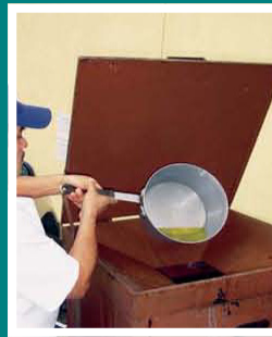
Collect waste oil and store for recycling.