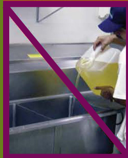
Do not pour waste oil directly into the drain, parking lot, or street.