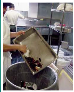
Dispose of food waste directly into the trash.