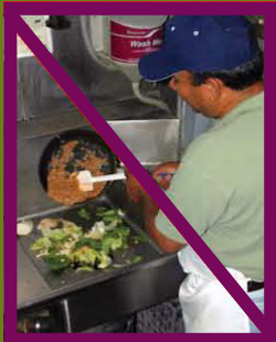
Avoid using the garbage disposal. Place greasy food in the trash.