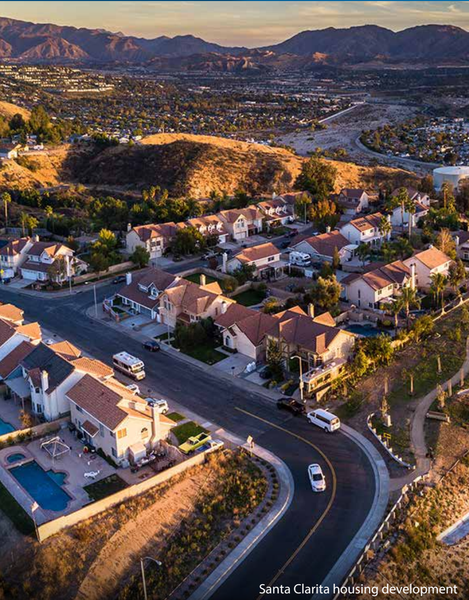
Santa Clarita housing development

The Municipal Services CSA is responsible for the development of safe, sustainable, and resilient communities. Services provided include efficient project entitlement, permitting, and inspection of residential, industrial, and commercial developments. Municipal Services CSA also enhances housing and community development by advancing affordable housing for low-income communities and persons experiencing homelessness. Additionally, Municipal Services CSA safeguards Los Angeles County communities by preparing for and responding to daily incidents; supporting County emergency operations during major emergencies and disasters; and collaborating with first responders, such as Sheriff, Fire, and Office of Emergency Management, to provide outreach on emergency preparedness and community resiliency. Municipal Services CSA strives to improve the management of disaster risks from both natural and human-caused hazards, to enable timely response, safe recovery, and to restore normalcy to communities.