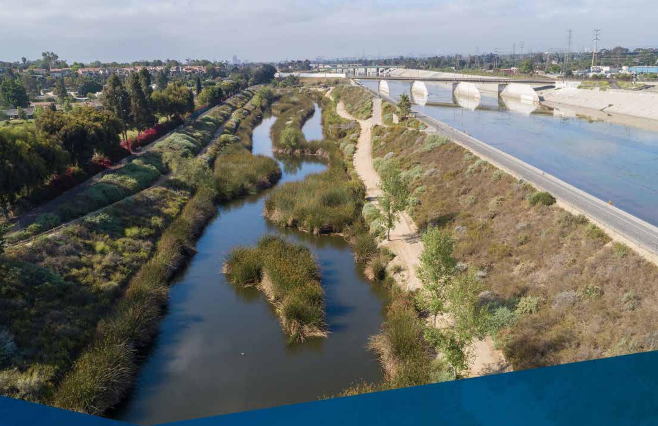
Dominguez Gap Wetlands