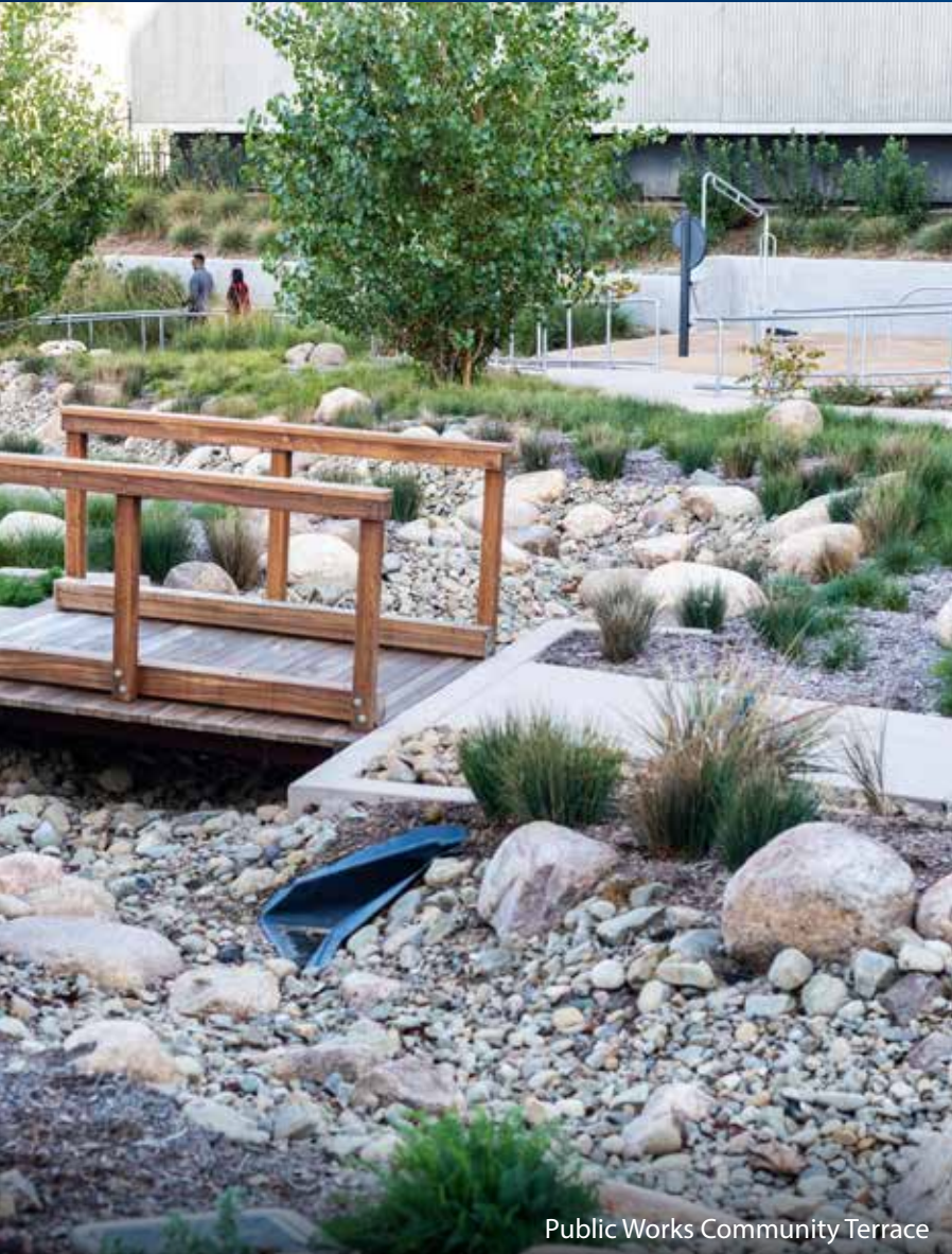
Public Works Community Terrace

Public Contracting and Asset Management (PCAM) provides highly skilled technical services to Public Works' Business Areas through modern infrastructure design, equitable contracting opportunities, and efficient asset management.