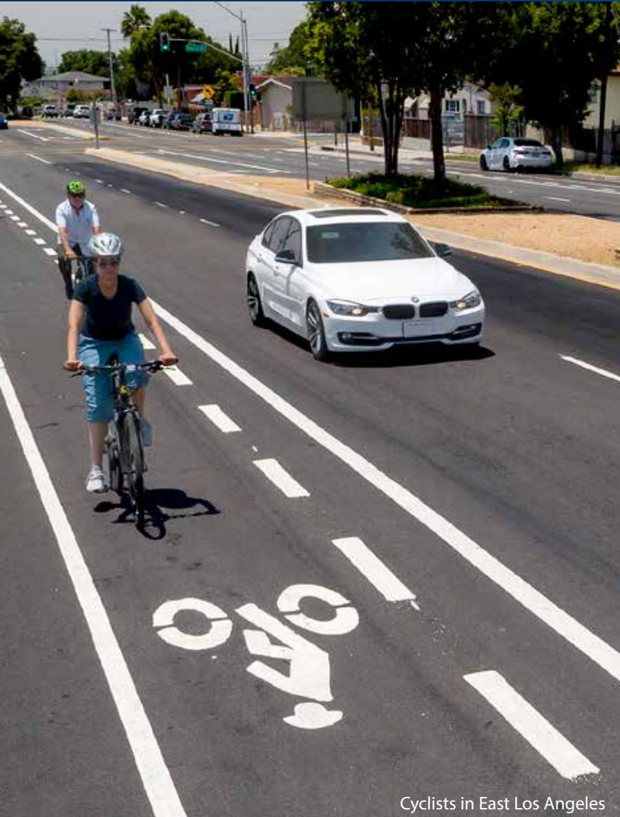
Cyclists in East Los Angeles

The Transportation CSA manages and maintains a vast network of roads, sidewalks, bridges, bicycle facilities, airports, and other transportation infrastructure in the unincorporated areas of the County as well as contract cities; and manages various programs and services to enhance safety and minimize traffic congestion. The Transportation CSA Business Plan establishes various strategies to improve community well-being and livability and to expand Countywide mobility and opportunities for alternate transportation choices.