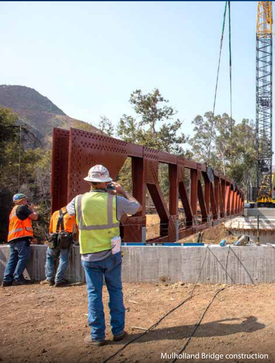
Mulholland Bridge construction

The Construction Management CSA provides program/project management services for the County's Capital Projects Program and Public Works' annual Infrastructure Program. This includes the renovation of existing buildings and the master planning, programming, and construction for new urban infrastructure and buildings for multiple County departments. The Construction Management CSA Business Plan establishes various strategies to deliver sustainable infrastructure and buildings that enable the County to provide goods and services to communities and County residents allowing them to thrive.