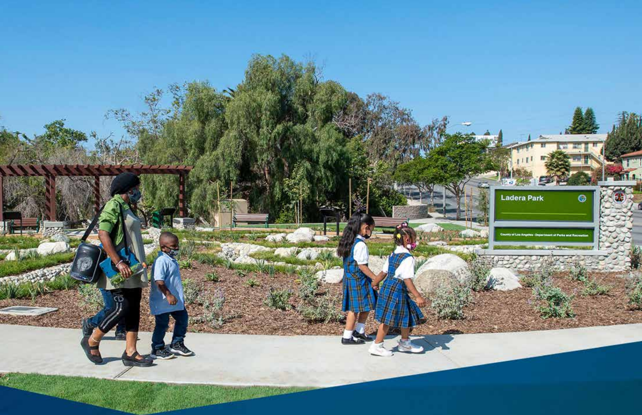
Ladera Park Stormwater Capture Project