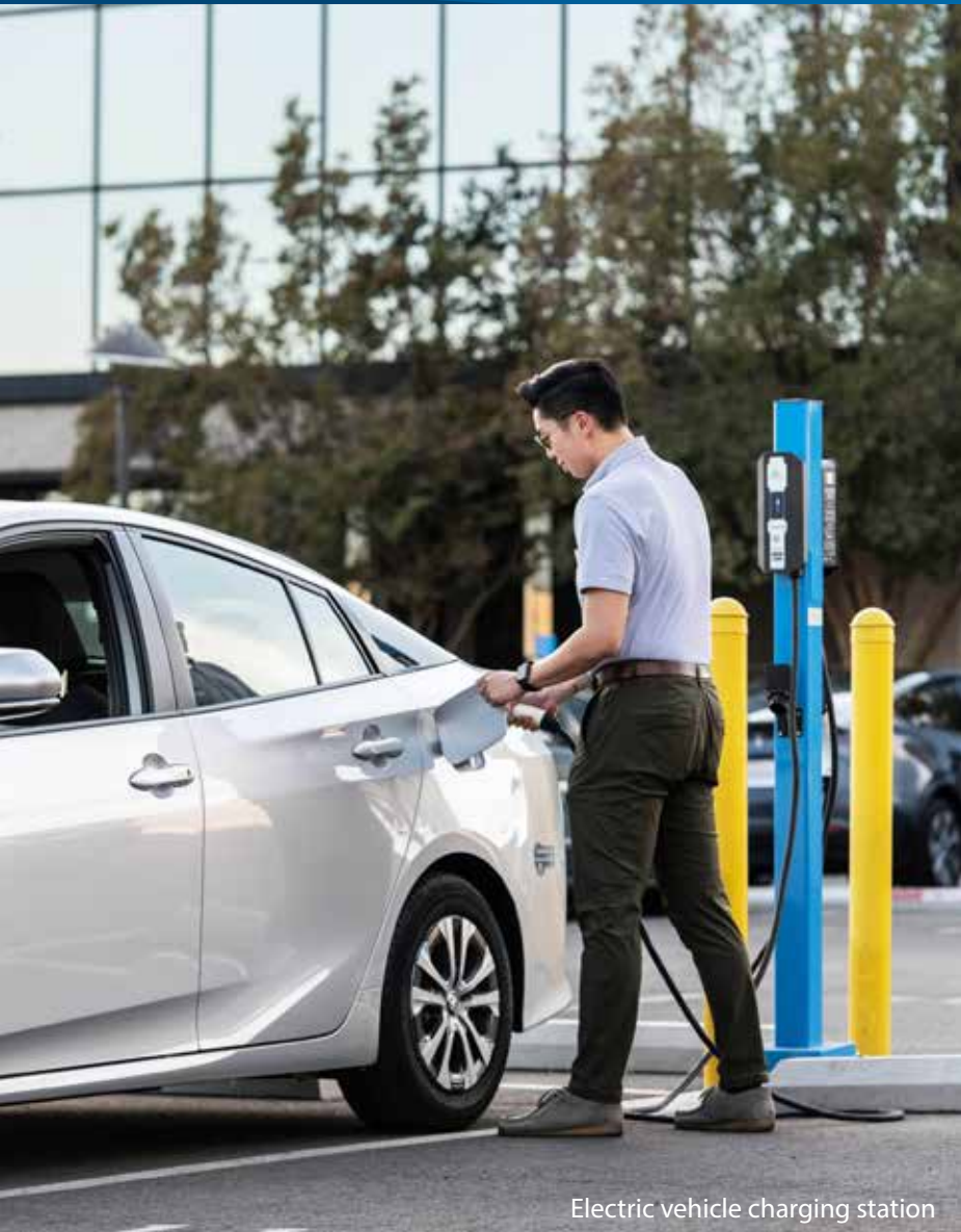
Electric vehicle charging station

The Environmental Services CSA provides solid waste management services, sewer maintenance, and environmental services to our unincorporated communities, contract cities, and the Los Angeles County region. The Environmental Services CSA also supports Public Works' workforce by maintaining a sustainable fleet, protecting employees' health and safety, and reducing risk where possible. The Environmental Services CSA manages solid waste infrastructure consisting of residential waste collection franchises, garbage disposal districts, and a commercial franchise system; manages, operates, and maintains sewer infrastructure within the Consolidated Sewer Maintenance District and the Marina Sewer Maintenance District comprised of sewer lines, sewage pumps, and wastewater control treatment plants; and is also responsible for Public Works' fleet, which includes on- and off-road vehicles and equipment. The Environmental Services CSA Business Plan establishes various strategies centered around equity, resiliency, and sustainability to pursue a waste-free future, optimized sewer infrastructure, and a carbon neutral fleet that will improve the environmental well-being of our communities.