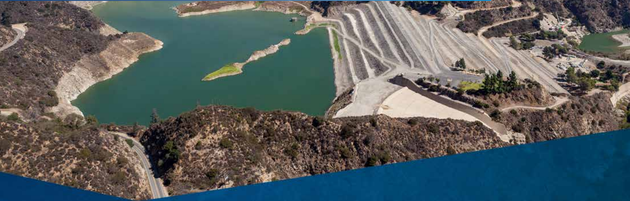
San Gabriel Dam

The Strategic Plan Framework reflects Public Works' alignment with the strategies and goals of the County of Los Angeles and the priorities of the Board of Supervisors. Five Strategic Focus Areas were identified to guide Public Works' business strategy over the next five years. Our Strategic Plan will serve as a tool for communication and decision making across the five Core Service Areas and two Support Service Areas of the Agency.