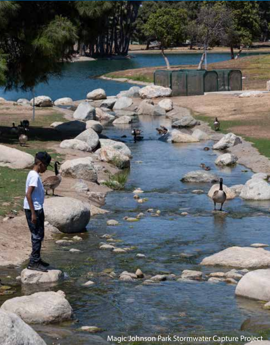
Magic Johnson Park Stormwater Capture Project

The Water Resources Core Service Area (CSA) is responsible for managing stormwater, providing potable water, and ensuring healthy watersheds for the safety and benefit of Los Angeles County communities. It plans, operates, and maintains infrastructure within the Los Angeles County Flood Control and Waterworks Districts through implementation of integrated water resource strategies. The Water Resources CSA Business Plan establishes various strategies to advance regional water resources management practices through the development of enhanced infrastructure, livable communities, and resilient and sustainable resources.