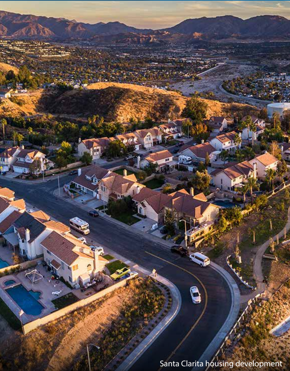
Santa Clarita housing development

The Municipal Services CSA is responsible for the development of safe, sustainable, and resilient communities. Services provided include efficient project entitlement, permitting, and inspection of residential, industrial, and commercial developments. Municipal Services CSA also enhances housing and community development by advancing affordable housing for low-income communities and persons experiencing homelessness. Additionally, Municipal Services CSA safeguards Los Angeles County communities by preparing for and responding to daily incidents; supporting County emergency operations during major emergencies and disasters; and collaborating with first responders, such as Sheriff, Fire, and Office of Emergency Management, to provide outreach on emergency preparedness and community resiliency. Municipal Services CSA strives to improve the management of disaster risks from both natural and human-caused hazards, to enable timely response, safe recovery, and to restore normalcy to communities.