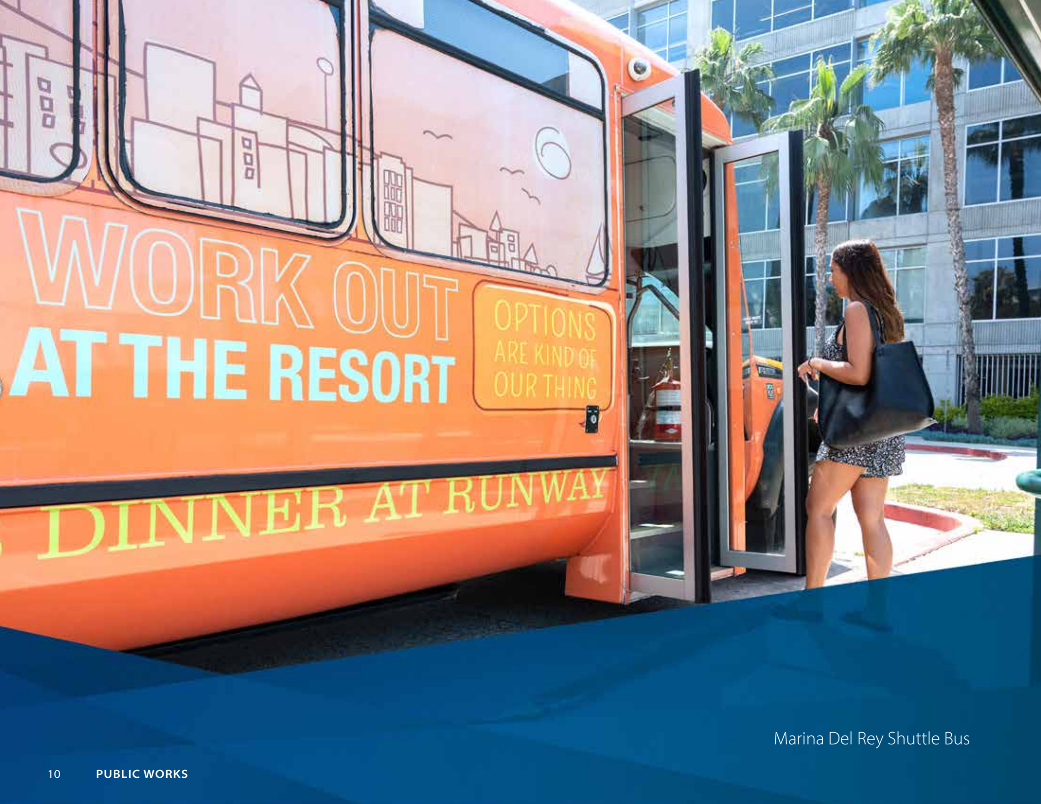
Marina Del Rey Shuttle Bus