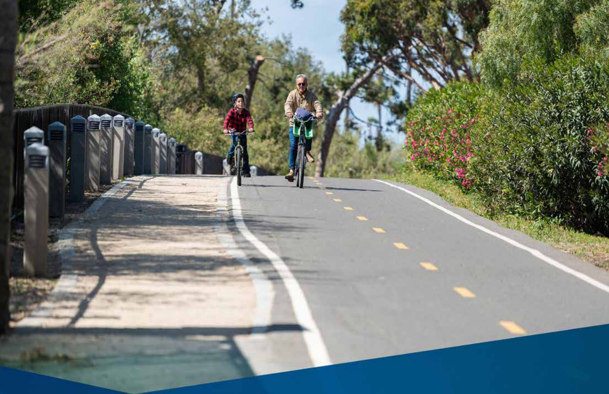
Residents using bike trails in Marina Del Rey