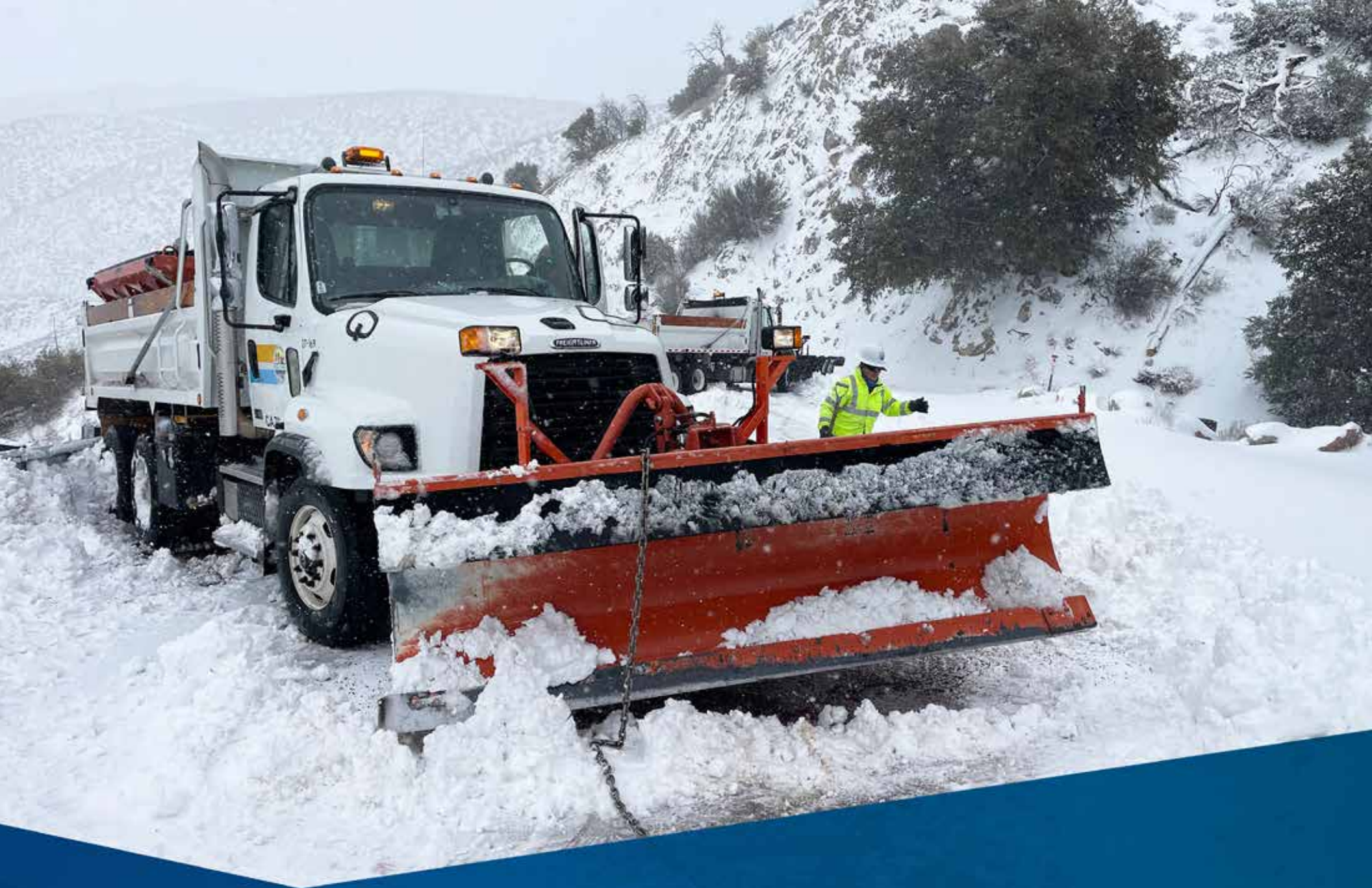
Public Works employees clearing snow on Los Angeles Crest Highway