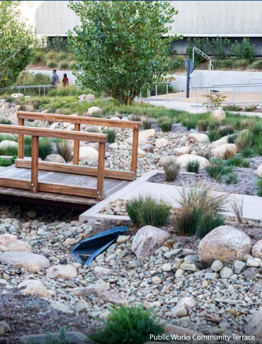
Public Works Community Terrace

Public Contracting and Asset Management (PCAM) provides highly skilled technical services to Public Works' Business Areas through modern infrastructure design, equitable contracting opportunities, and efficient asset management.