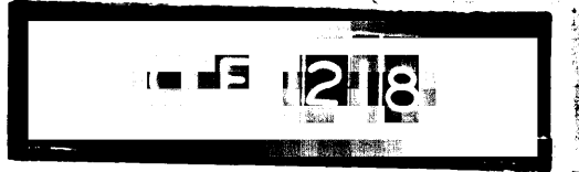
EXHIBIT "B" NOTE SHADED PORTIONS SHOW LAND TO BE CONDEMNED

CITY OF PASADENA OFFICE OF CITY ENGINEER & SUPERINTENDENT OF STREETS LAKE AVENUE COLORADO ST. TO CALIFORNIA ST. DATE 05-19-54 SCALE 1" = 100' DRAWING NUMBER G-291