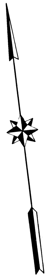
EXHIBIT - A.