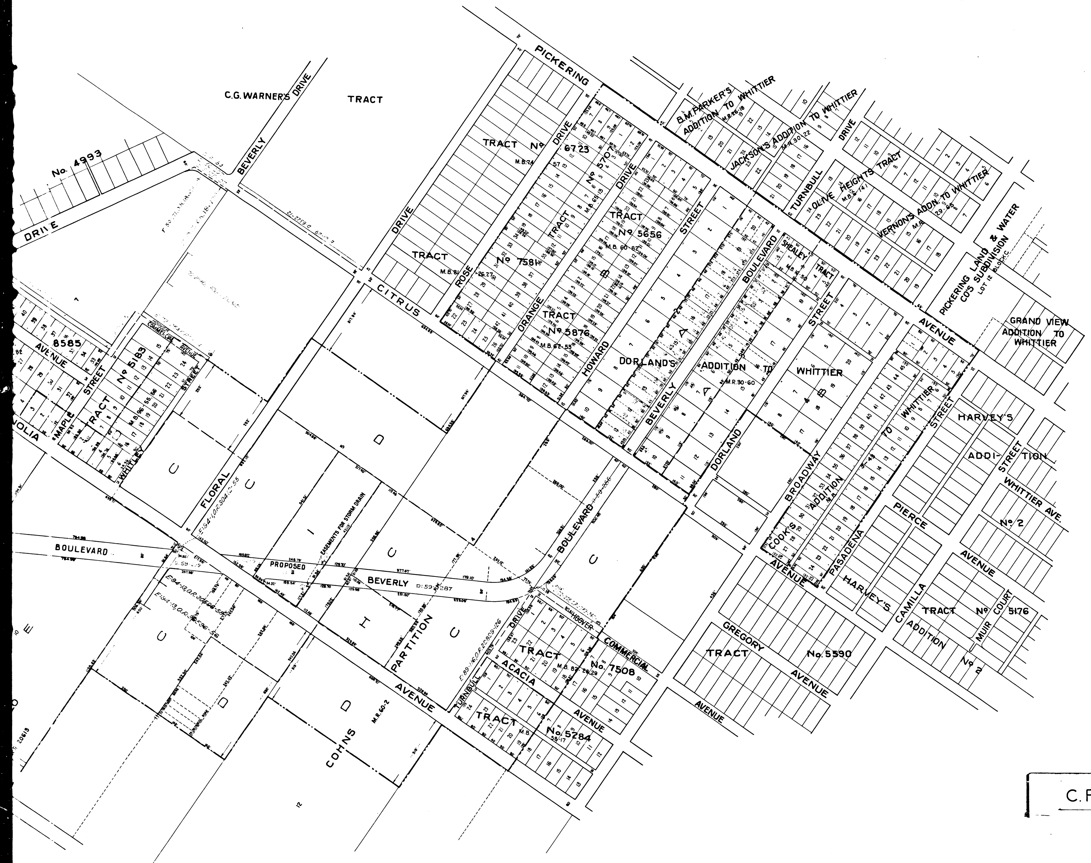
EXHIBIT "A" MAP OF ACQUISITION AND IMPROVEMENT DISTRICT NO. 1 OF THE CITY OF WHITTIER

Hereon the mark ' means feet. Small figures next to the property lines show, each, the length of adjacent line in feet. Larger figures show numbers of the lots. Dotted lines show property lines in those cases where the actual holdings differ from the recorded subdivisions. ——— Indicates the exterior boundaries of the assessment district. - - - - - Indicates the boundaries of the different zones. The different zones are designated by large letters, as, - E Lands to be taken are indicated thus: — □ — Small figures in circles, as, - ① - indicate the numbers of the various parcels to be taken. Hereon M.R. means Miscellaneous Records and M.B. means MapBook All records referred to hereon are records of Los Angeles County, California.