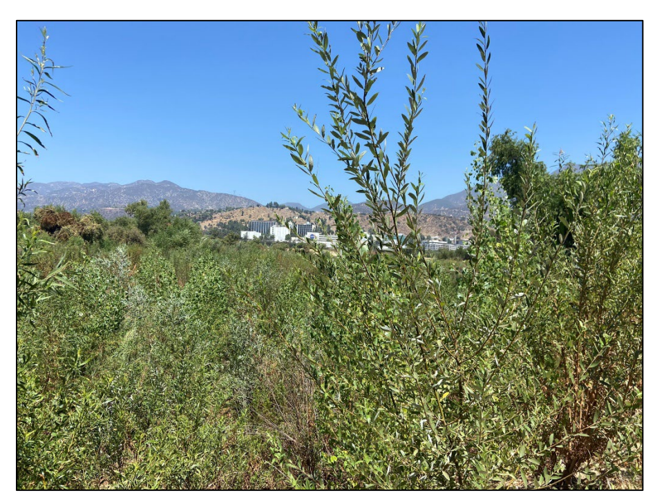
Photo 6: Overview Mitigation Area DG-2, DG-2 New Channels, DG-2 WOUS