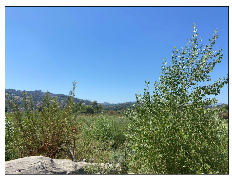
Photo 2: Overview Mitigation Area Overview Mitigation Area DG-W-1 (Johnson Field)