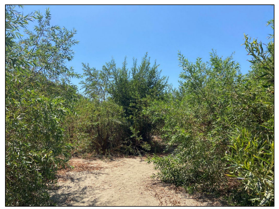
Photo 3: Overview Mitigation Area Overview Mitigation Area DG-2 & DG-2 WOUS