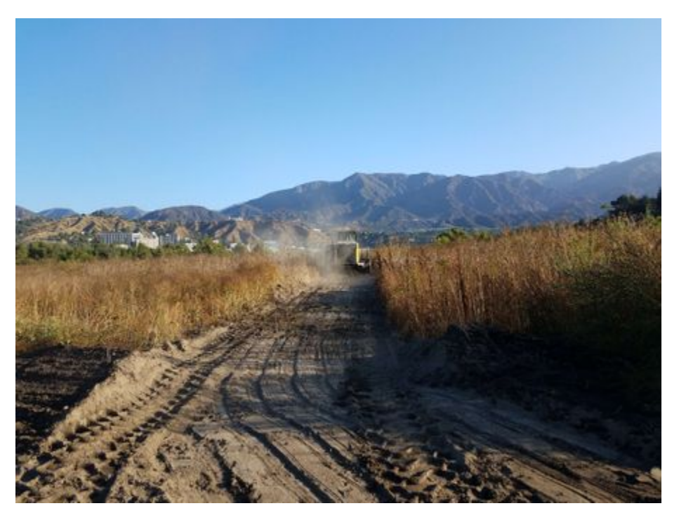
Log Entry Photo C