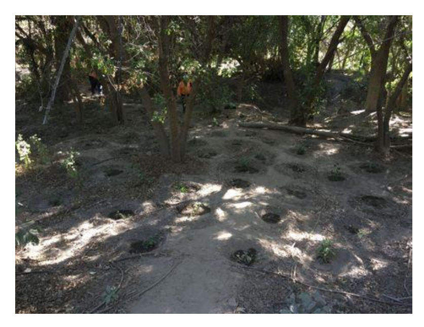
Were ESA (Endangered Species Act) permits adhered to during the monitoring activities?