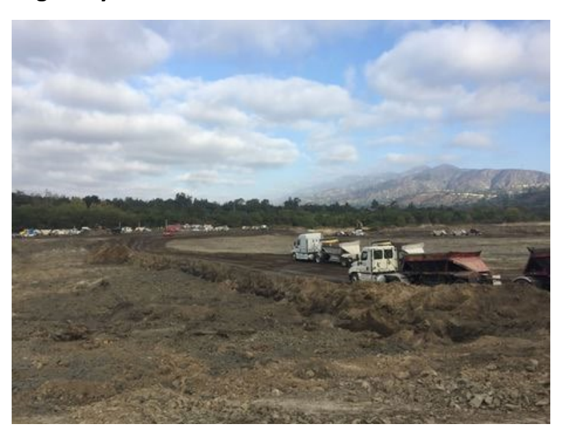
Log Entry Photo B