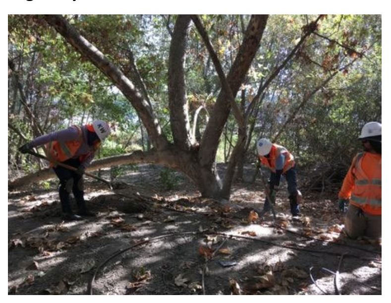
Log Entry Photo B