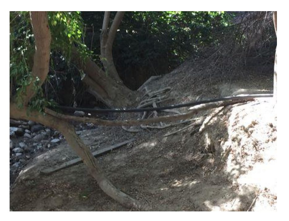
Log Entry Photo C