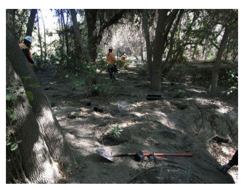
Log Entry Photo B