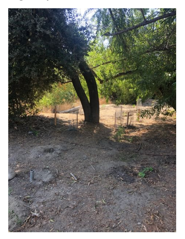
Log Entry Photo C