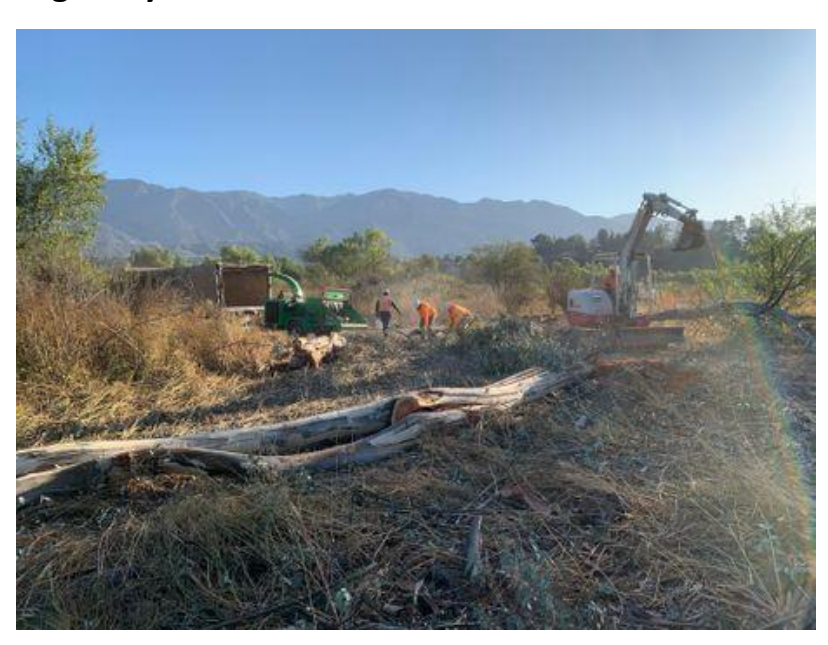
Log Entry Photo B