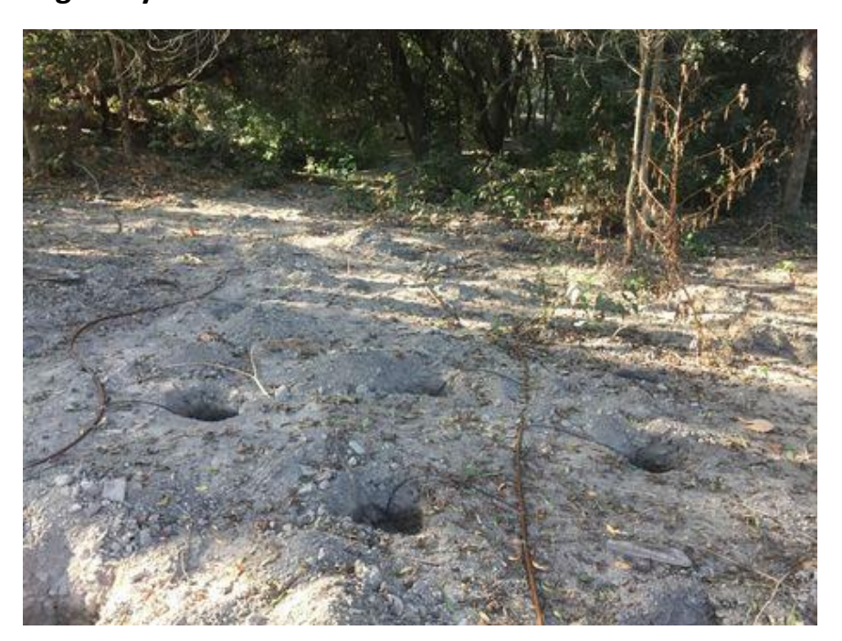
Were ESA (Endangered Species Act) permits adhered to during the monitoring activities?