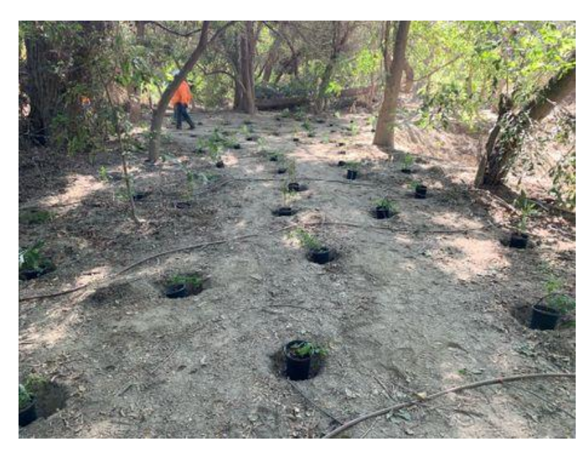
Were ESA (Endangered Species Act) permits adhered to during the monitoring activities?