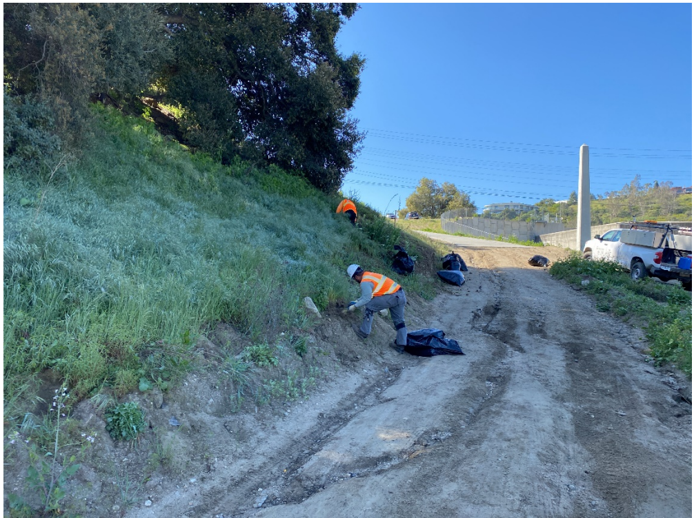
photo_1- Weeding crew at work.jpg