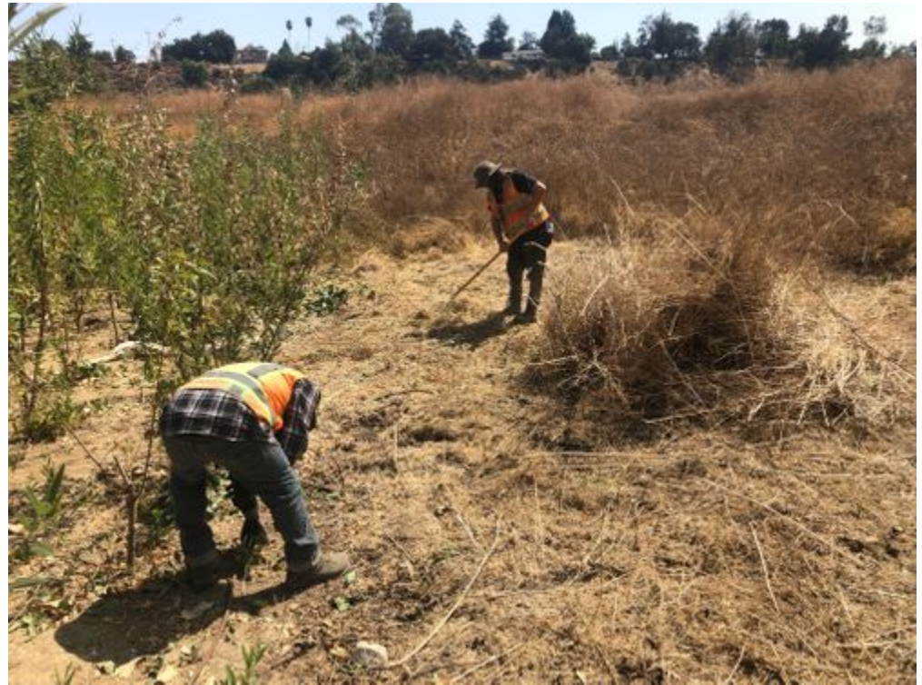
Hand pulling in DG-4.jpg