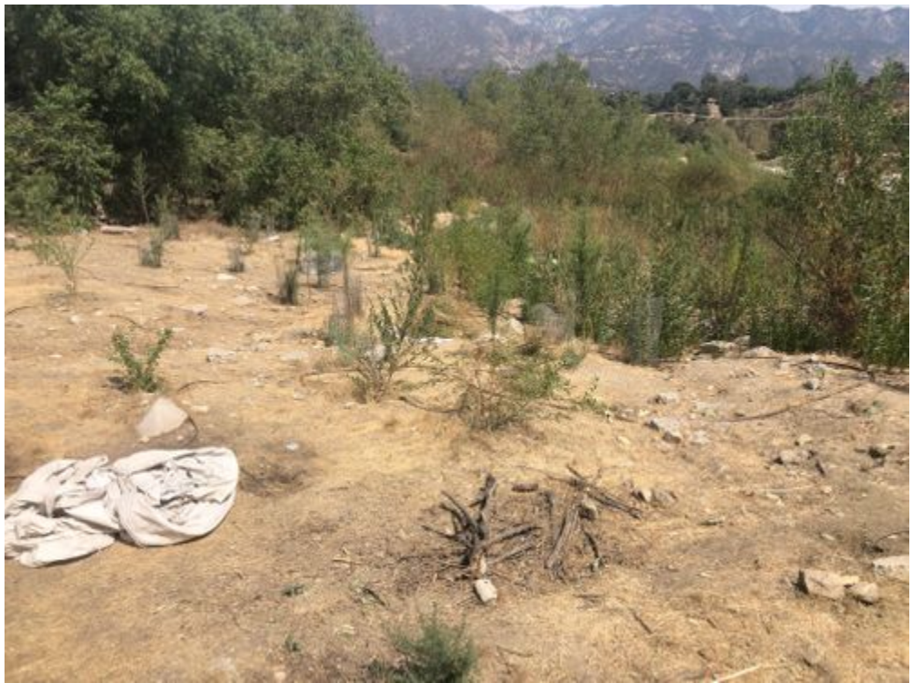
Vegetation removal after.jpg