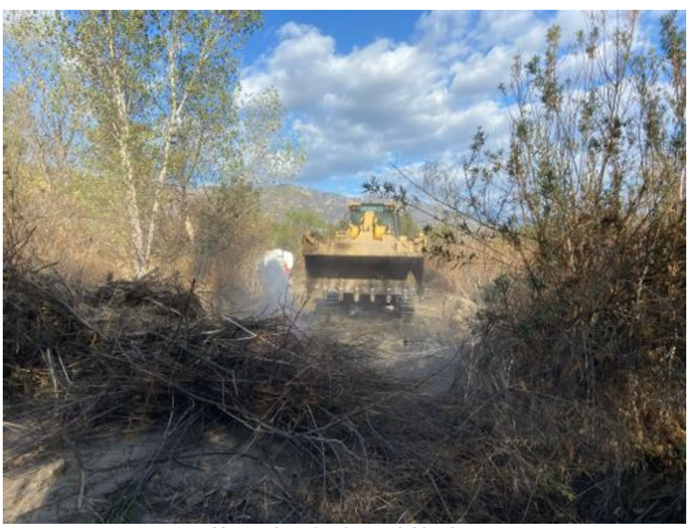
Vegetation clearing activities.jpg