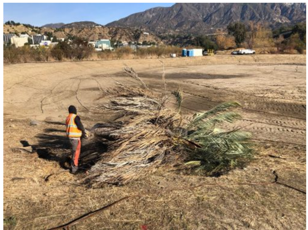
Palm chopping_johnson field_after.jpg