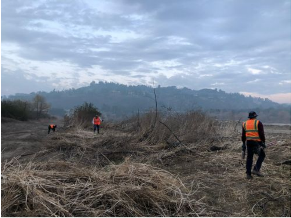
Vegetation clearing_before_facing S.jpg