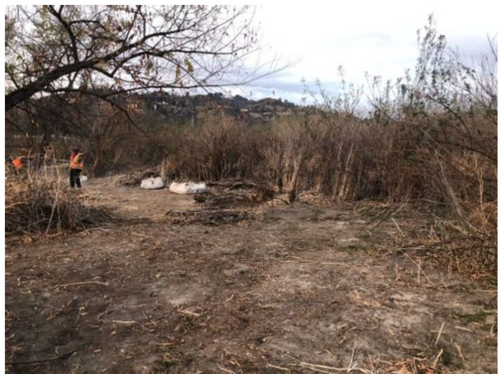
Vegetation clearing before facing S.jpg