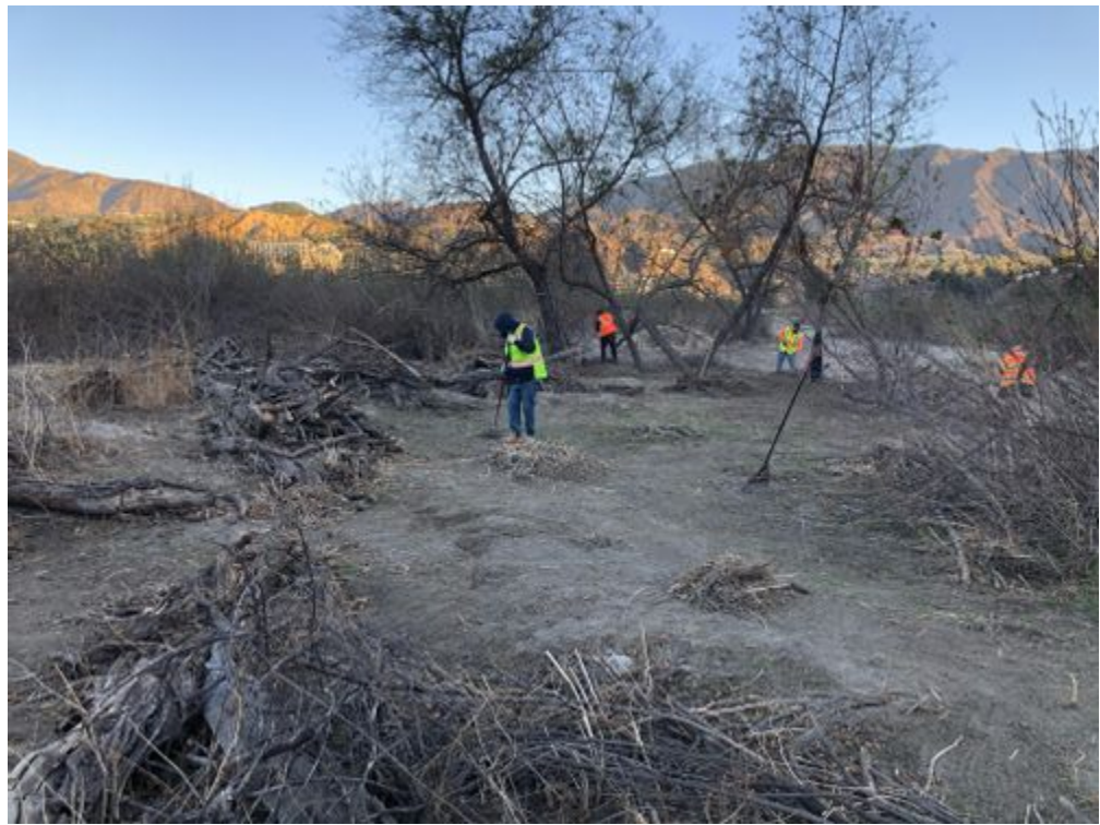
Vegetation clearing_before_facingE _2.jpg