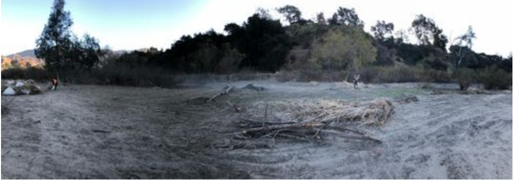
Vegetation clearing_before_facingE _1.jpg