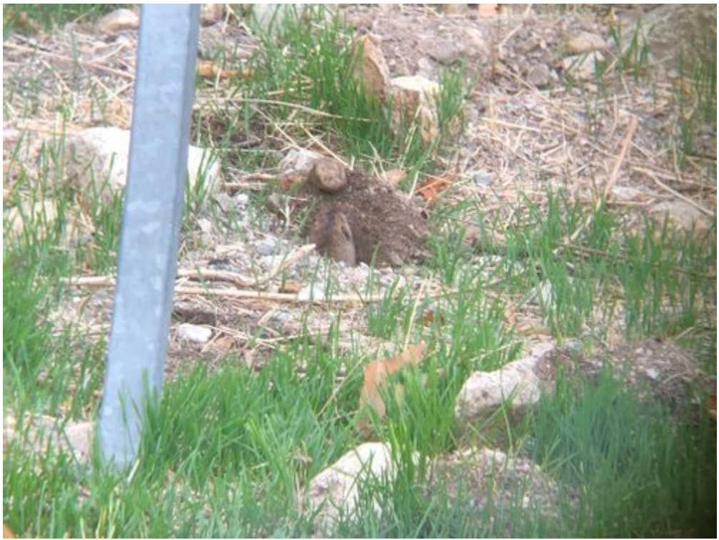
Bottas pocket gopher.jpg