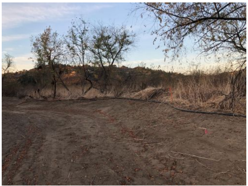
vegetation clearing_before_facing W.jpg