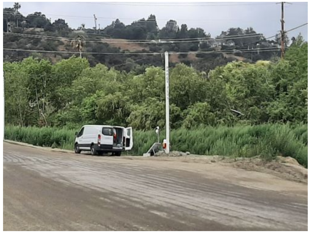
Camera and solar installation along western haul road and powerline.jpg