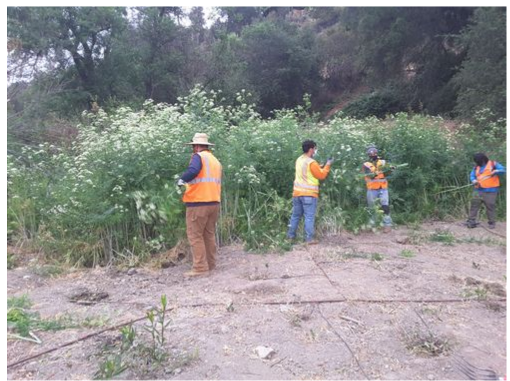
DG-2 New channels_facing North_BUSH14 buffer.jpg