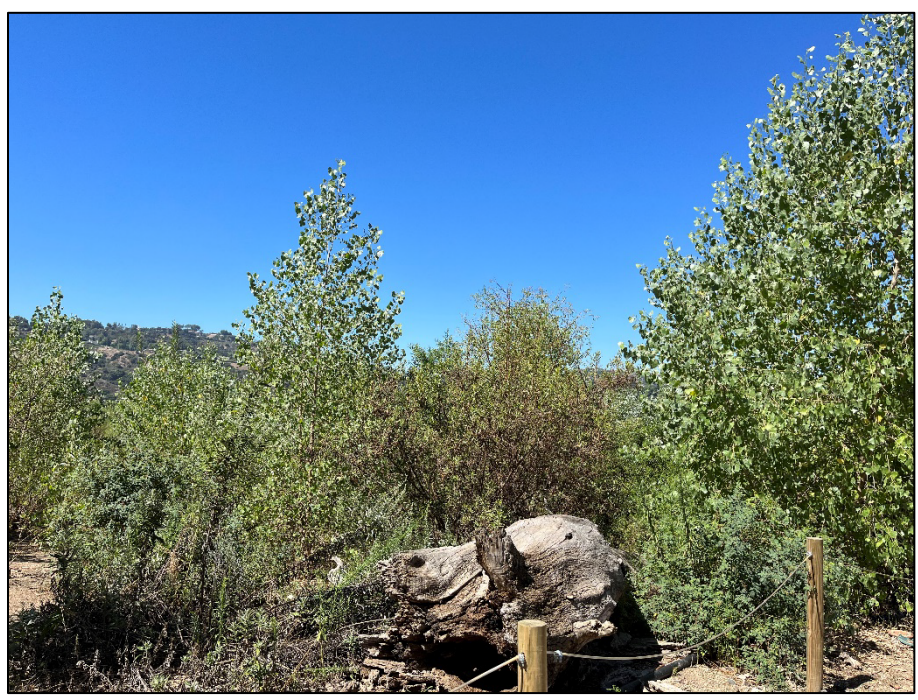
Photo 2: Overview Mitigation Area Overview Mitigation Area DG-W-1 (Johnson Field)