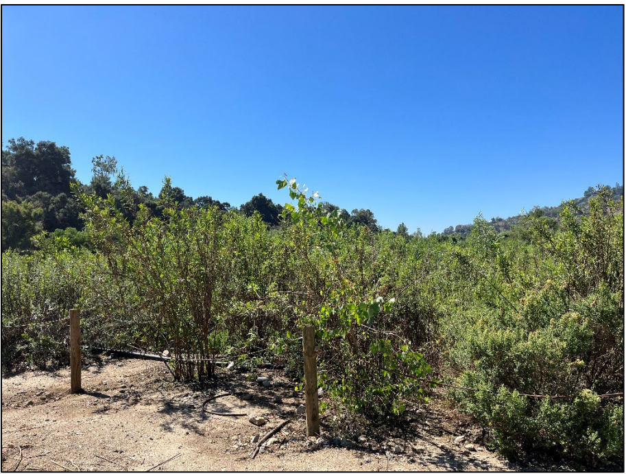
Photo 3: Overview Mitigation Area Overview Mitigation Area DG-W-1 (Johnson Field)