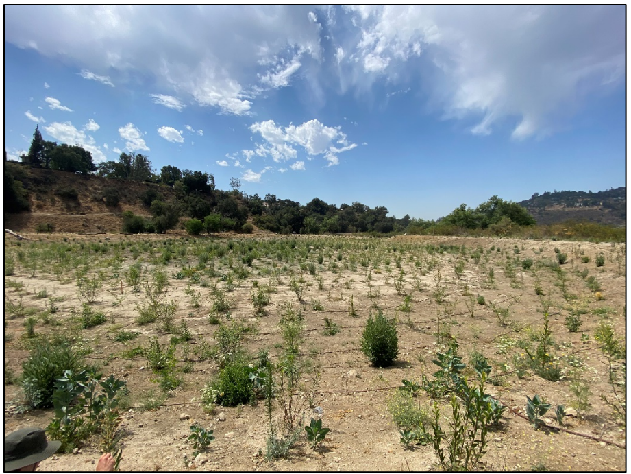
Photo 3: Overview Mitigation Area Overview Mitigation Area DG-W-1 (Johnson Field)