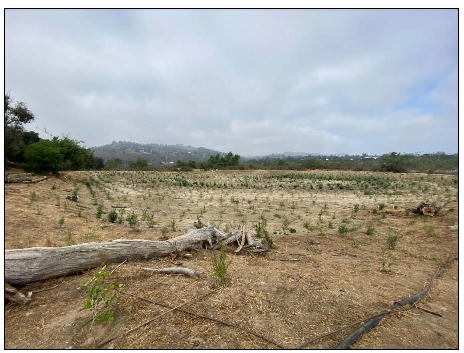
Photo 2: Overview Mitigation Area Overview Mitigation Area DG-W-1 (Johnson Field)